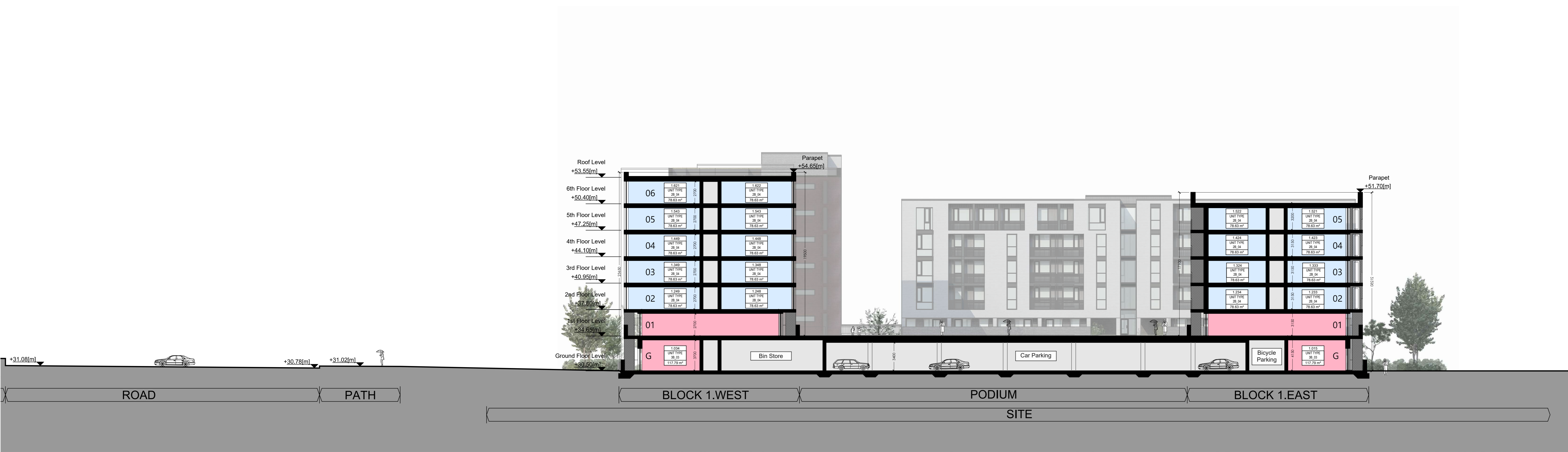
Section AA - Block 1 Scale 1:200 @A0